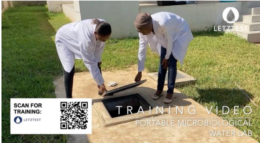
Figure 3 – A QR code in each kit leads you to a training video

Each kit contains a QR code that leads to a practical training video . In case of further questions, the end user can also directly and easily contact a LETZTEST technician via a second QR code.