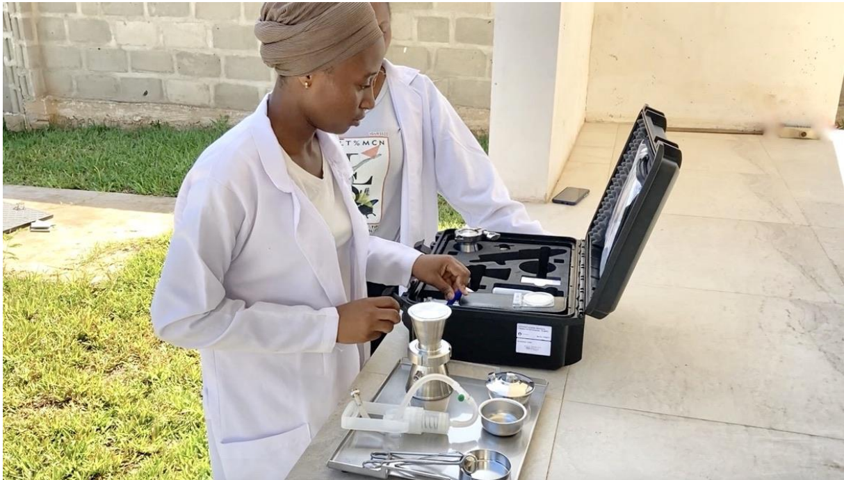
Figure 1 – The Portable Membrane Filtration Kit is part of the complete portable water microbiology laboratory by LETZTEST

Quantify E.coli and other faecal bacteria in water samples closely following DIN EN ISO 9308-1, in remote places. The portable kit is perfectly suited to the requirements of a water testing laboratory under limited conditions: (i) robust, (ii) non-electrical, (iii) easy to transport, (iv) easy to use, (v) independent of inappropriate consumables, (vi) less prone to human error.