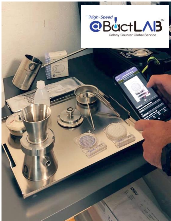
Figure 4 - The BactLAB App allows you to read your result in one second

The BactLAB App allows you to read the results of your tests in one second using the camera of your smartphone, for free!