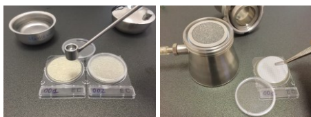
Activation and placing Membrane Filter after sample filtration with the portable LetzTEST Membrane Filtration Kit